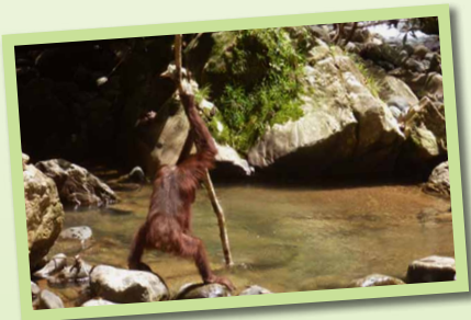
Testing the waters, clever Mail checks the river level.

By the end of 2012 we hope to bring that number close to 50 releases.